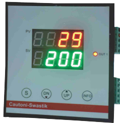
TIMER + RPM CARD