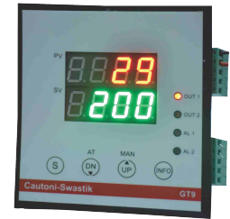
TEMP. CONTROLLER CARD